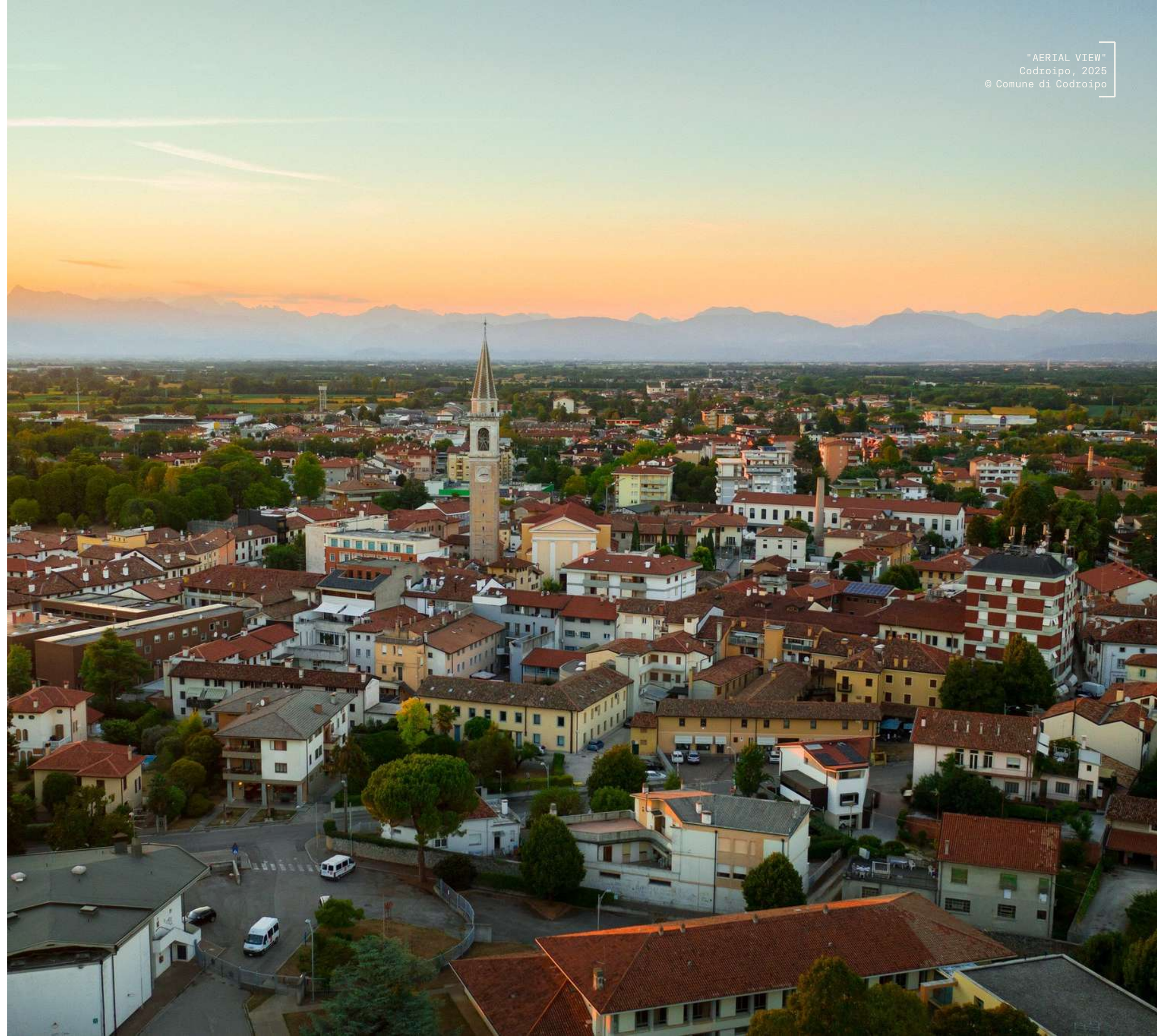
"AERIAL VIEW" Codroipo, 2025

It is within this context that Codroipo is found: a small urban centre combining the calm of provincial life with a vibrant cultural and social scene. A place that, while maintaining a human-scale dimension, looks attentively toward future challenges.